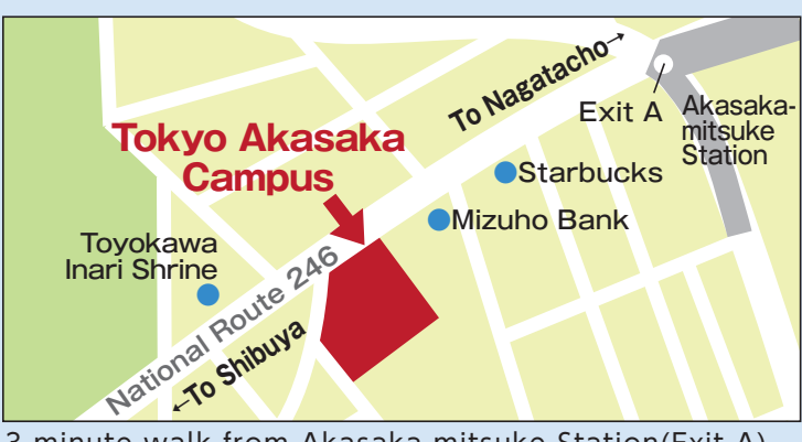
3-minute walk from Akasaka-mitsuke Station(Exit A)