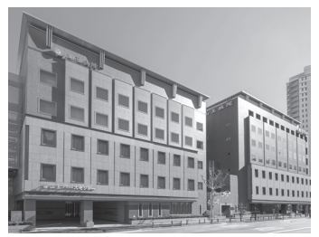
Sanno Hospital / Sanno Birth Center Number of Beds: 79/19