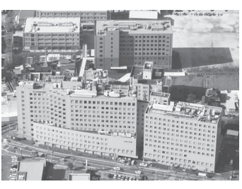
Takagi Hospital Number of Beds: 506